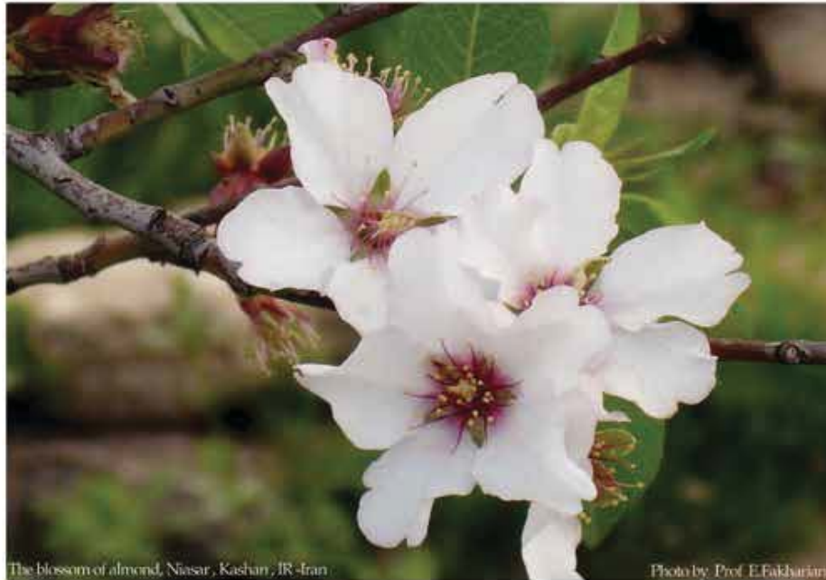
The blossom of almond, Niasar, Kashan, IR-Iran